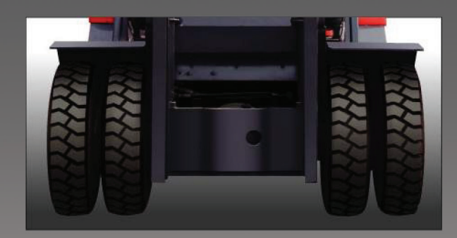
Stable double front wheel