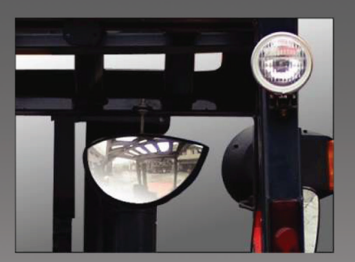
Wide angle rearview mirror